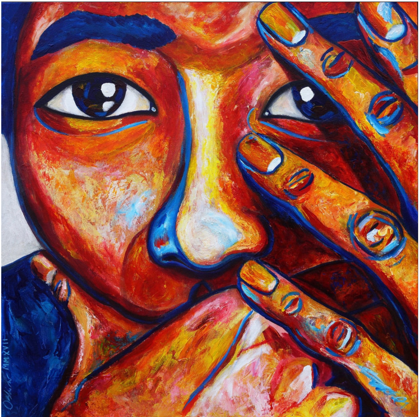
"Takashi" acrylics on canvas. 36 in x 36 in.