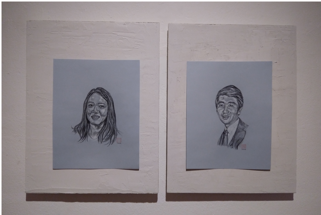
Frames made of gesso on wood.