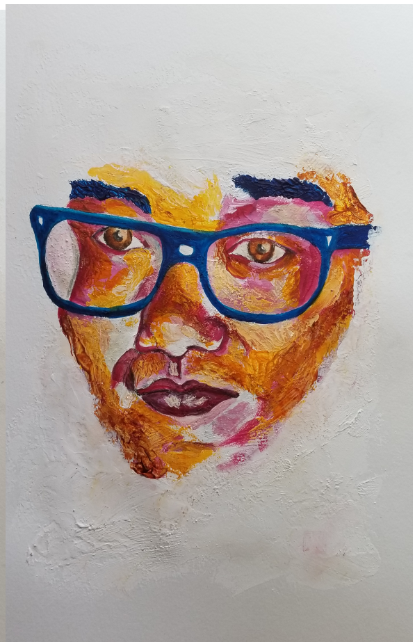
Mixed media on paper