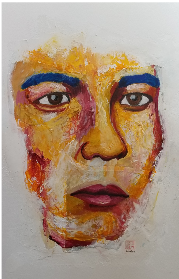
Mixed media on paper.