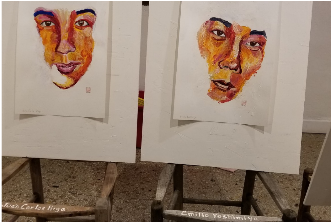
Hand made chairs/Mixed media/Boards with gesso.