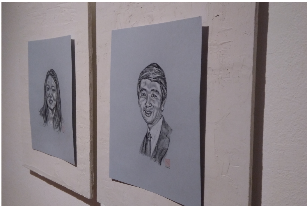
Charcoal on paper,