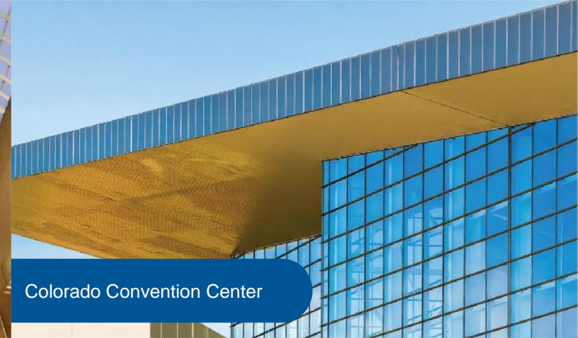
Colorado Convention Center