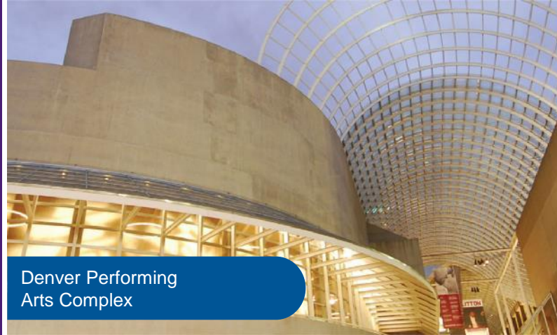
Denver Performing Arts Complex

In addition, Denver Arts & Venues' Public Art team oversees the City of Denver's Public Art program, and its Cultural Affairs team supports cultural advancement in Denver through grant making, offering free and low-cost cultural events, partnering with local organizations, and advancing arts education.