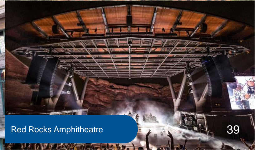
Red Rocks Amphitheatre